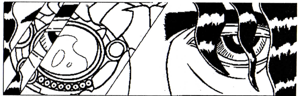
Art work by Jade Todd